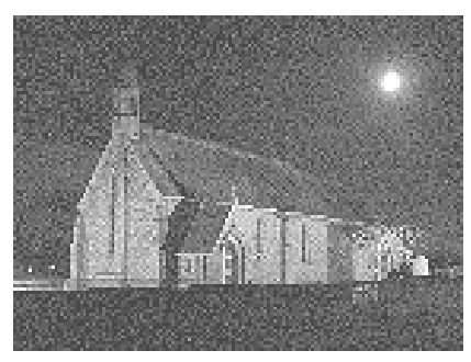
St Paul's church Aldbrough St John

If you would like to help St Paul's by sponsoring the floodlighting, please read on.